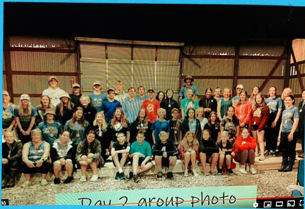
Day 2 group photo