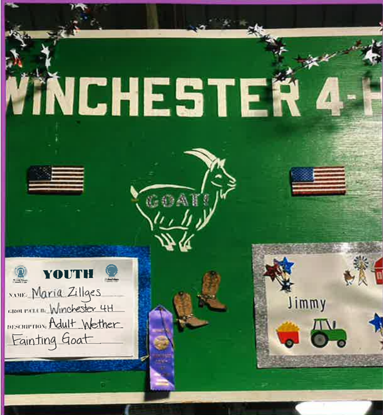
The amazing decorations ↑↑