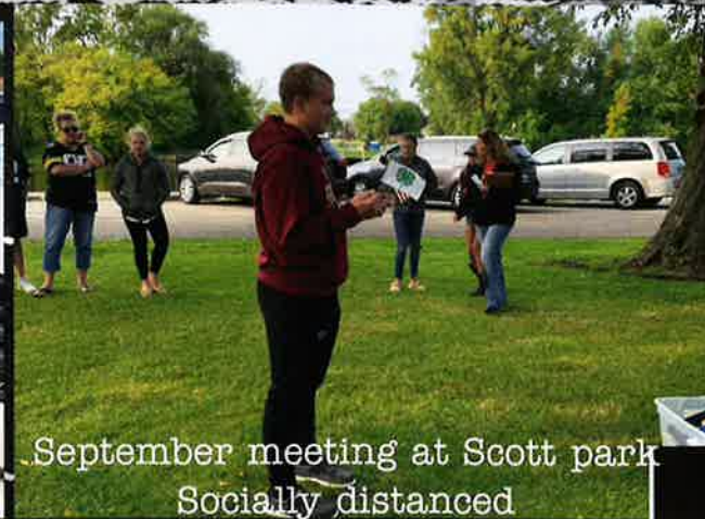
September meeting at Scott park Socially distanced