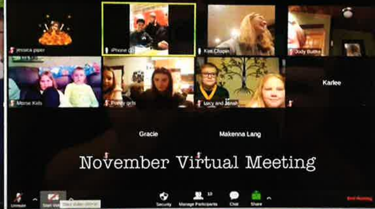
November Virtual Meeting