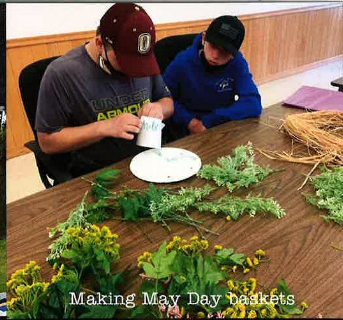
Making May Day baskets