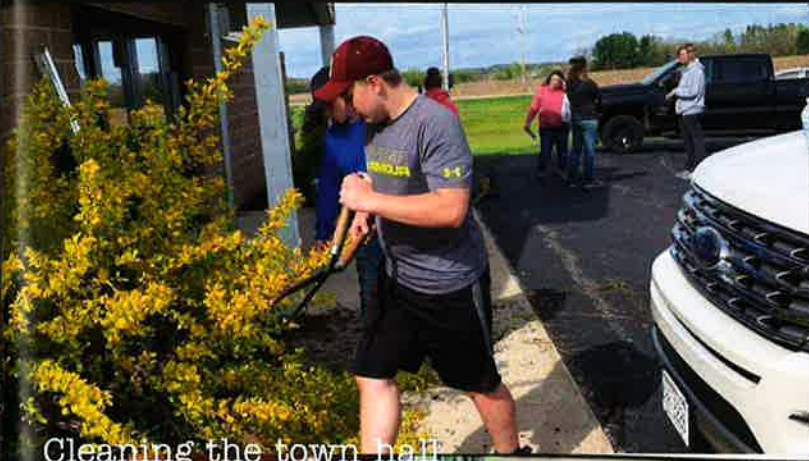
Cleaning the town hall