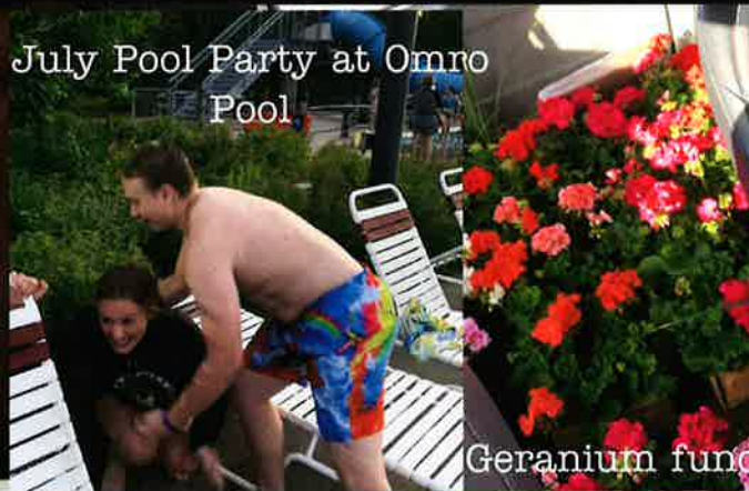
July Pool Party at Omro Pool