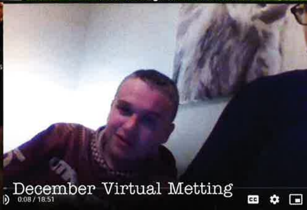
December Virtual Meeting