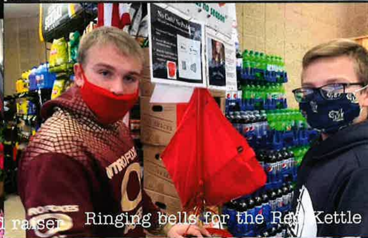
Geranium fund raiser Ringing bells for the Red Kettle