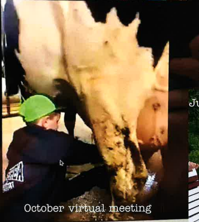
October virtual meeting